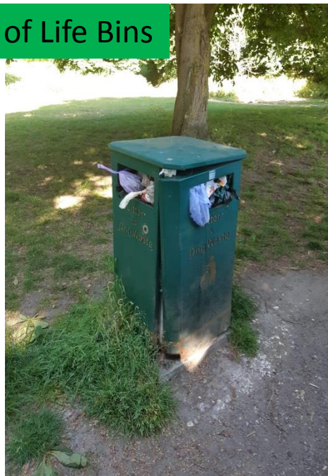
End of Life Bins