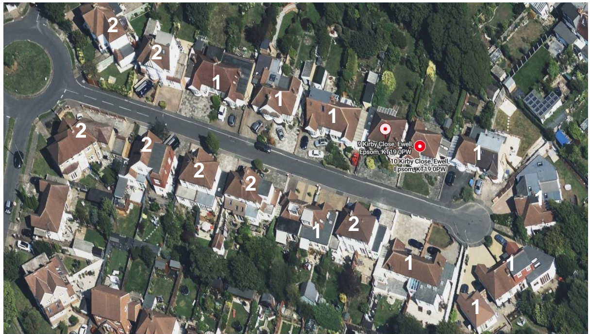
Height of properties in Kirby Close

Planning Committee Planning Application Number 24/01462/FUL