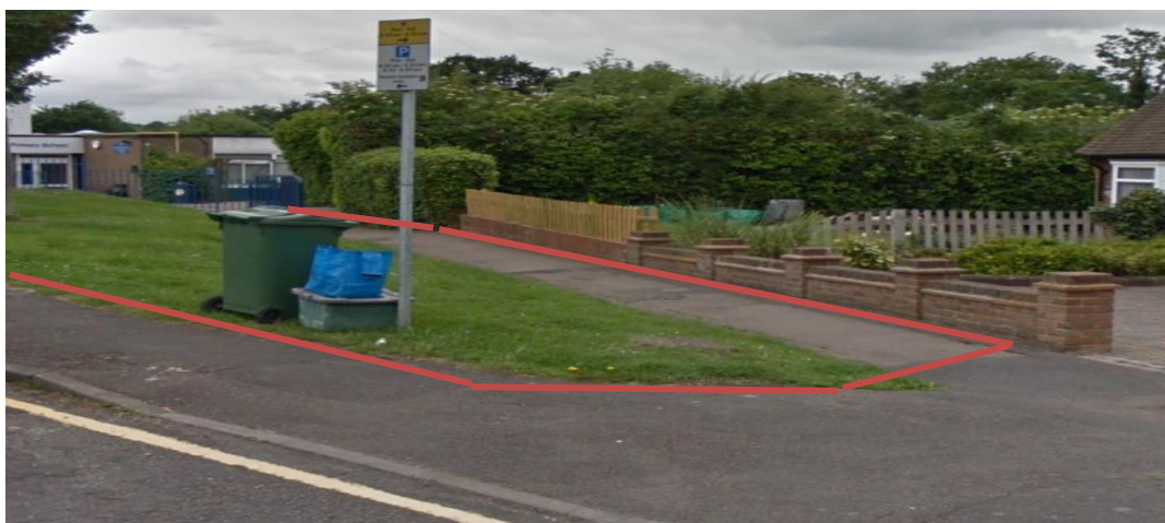
Picture 2: Narrow footway to pedestrian entrance of St Josephs. The verge and footway (outlined in red) belong to Epsom and Ewell Borough Council