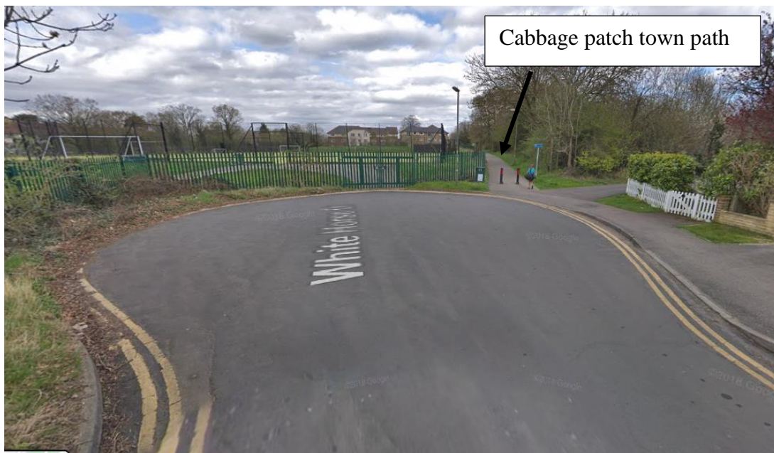
Picture 3: Turning Circle, Whitehorse Drive leading to Cabbage Patch Town Path

Whitehorse Drive is also a cul-de-sac with a 30mph speed limit and is accessed from Dorking Road. This is a residential road of 400m length with Rosebery school along the west of the road. There are parking restrictions on only the west side of Whitehorse Drive for most of its length, and vehicles park along the east side. The carriageway is approximately 6m wide and there is a turning circle at the end. White Horse Drive is connected to Dalmeny Way (Rosebank) via the cabbage patch town path which is a shared footway / cycleway. Along this town path there is a gate which St Joseph's School use as a second point of access for their pupils. Parents use the turning circle in Whitehorse Drive as an ad-hoc 'kiss and drop' facility. The turning circle is monitored by a member of St Joseph's staff.