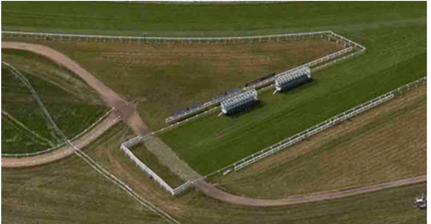
Current Raceday arrangements – grass clippings deployed to 'blind' the crossing